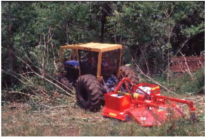
Figure 3: Clearing small-diameter brush with a mower that treats the brush stubble with herbicide as it cuts. This provides increased recovery area and sight distance, and prevents brush re-establishment.

When soil needs to be taken from borrow areas, choose sites that do not contain perennial weeds. If there are sites designated as borrow areas, include these areas in routine weed management programs to prevent weeds from getting established and spreading to other sites.