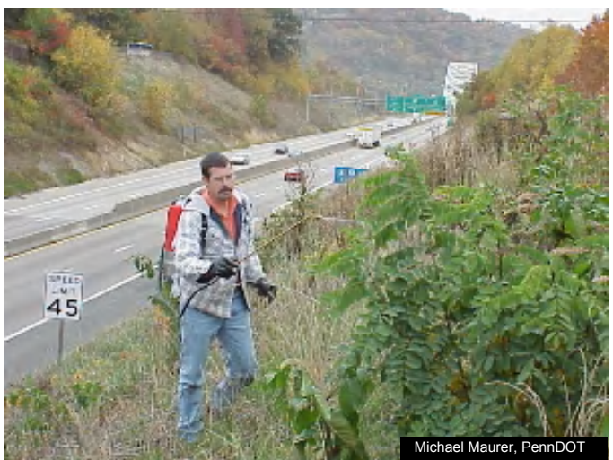
Figure 6: A selective application of an herbicide mix to roadside brush. The backpack sprayer with a nozzle that delivers a small volume of spray solution is well suited to selectively treating target weeds and leaving the desirable groundcover uninjured.

IVM is more than simply being able to say that you have a whole 'laundry-list' of programs for managing vegetation. Coordinating, or integrating these elements together to get you closer to your desired groundcover is