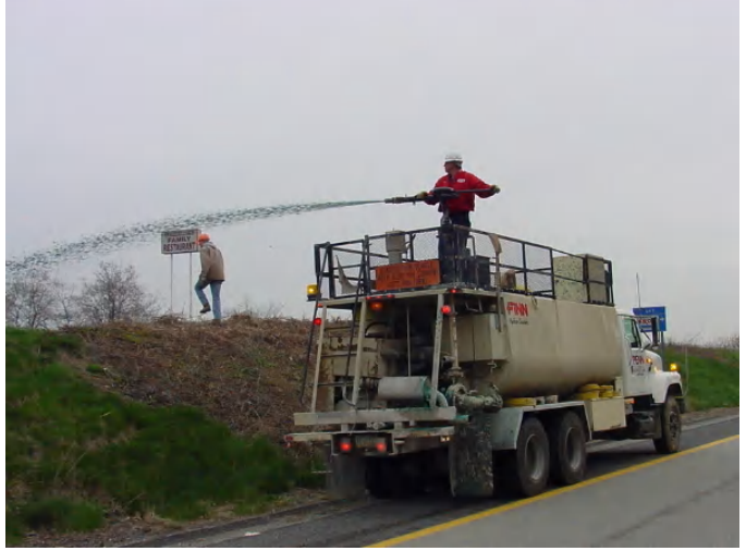
Figure 2: Hydraulic seeding of a mixture of grasses to a roadside area where brush has been cleared. Establishing a competitive groundcover by selecting a well-adapted plant material and using proper establishment procedures helps reduce the opportunity for weeds to infest the roadside.

For our discussion, desirable vegetation is simply any vegetation that is not problem vegetation. Intact,