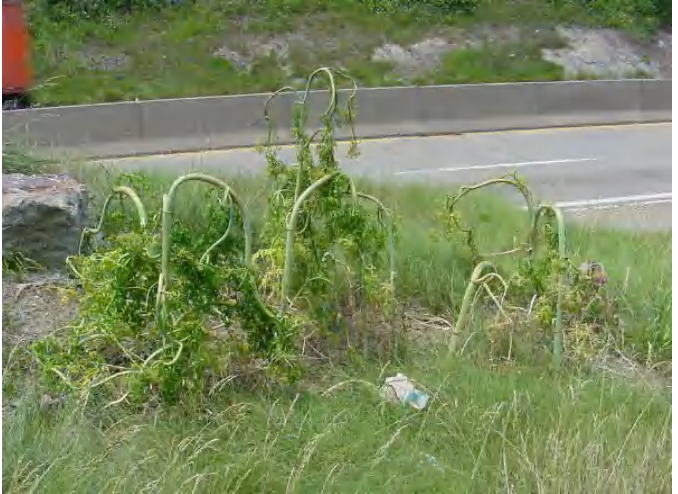
Figure 5: Poison hemlock, injured by an application of a selective herbicide that injures broadleaved weeds but not grasses.

An example of a selective soil application would be controlling crabgrass in a home lawn. The herbicide, often combined with a fertilizer as a 'weed-and-feed' product, is applied in the spring before crabgrass germinates. This herbicide is only effective on germinating seedlings because it prevents roots from growing, and because it is immobile in the soil and stays at the soil surface - where the crabgrass seed is. The roots of the lawn grass are already present, and they are growing beneath the herbicide, so the turf is not affected. This is also why some herbicides can be applied in a flower bed right after you plant the flowers - the flowers already have a developed root system and the root system is below the herbicide.