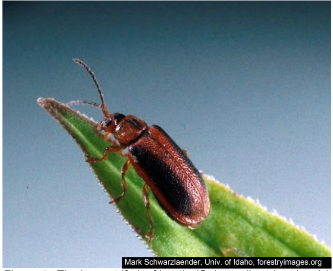
Figure 4: The loosestrife leaf beetle (Galerucella calmariensis) has been released in Pennsylvania and throughout the U.S. to provide biological control of purple loosestrife.

native range of the pest plant to attack it. Releasing biological control agents is a highly regulated process, and requires that extensive testing be done to ensure that the biological control agent is not only effective, but will limit its effects to the target species.