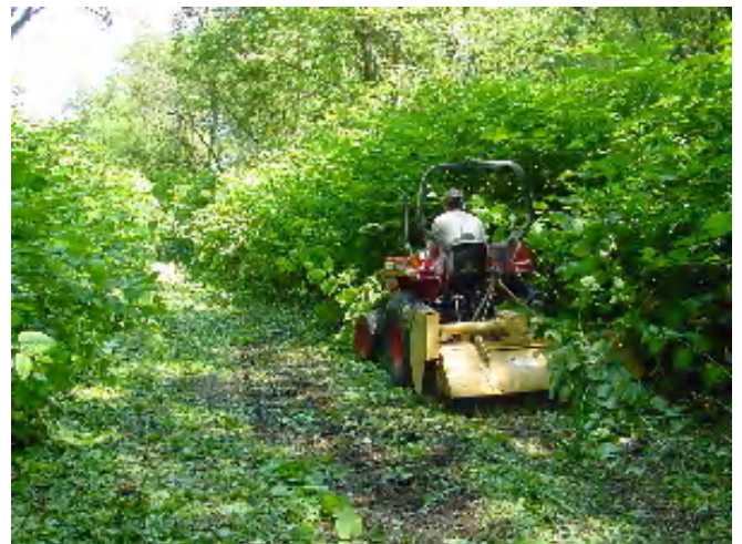
Figure 5. Despite its imposing height, knotweed is non-woody and is readily cut. Where terrain permits, it can be mowed. Cutting around June 1 in Pennsylvania will eliminate the canopy and result in regrowth that is only 2 to 4 ft tall, making follow-up herbicide applications easier.