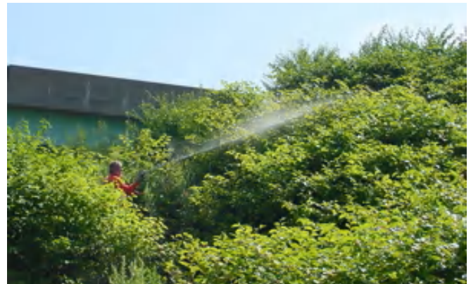
Figure 7. A high-volume foliar application is the best method to treat knotweed that has not been cut. This application should be made after July 1 and before a killing frost.