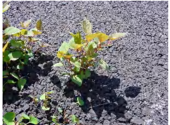
Figure 3. Knotweed shoots emerging through asphalt. Knotweed not only limits sight distance, it physically damages shoulders and road edges.

Encouraging or establishing alternative groundcover provides competition to knotweed, and will enhance the effects of other treatments. However, Japanese knotweed appears to inhibit the growth of other plants. In trials