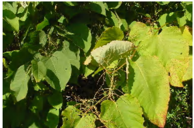
Figure 2. Japanese knotweed (left) and giant knotweed (right) occur throughout Pennsylvania. The leaves of Japanese knotweed are usually 4 to 6 inches long, while the leaves of giant knotweed can reach 12 inches in length and are distinctly heart-shaped. Though often confused with each other, there is little chance of confusing these imposing plants with any other species. The knotweeds have similar adaptations and growth habits, and can be regarded as equally problematic.

By Art Gover, Jon Johnson, and Larry Kuhns, 2005. This work was sponsored by the Pennsylvania Department of Transportation. The contents of this work reflect the views of the authors who are responsible for the facts and the accuracy of the data presented herein. The contents do not necessarily reflect the official views or policies of either the Commonwealth of Pennsylvania or The Pennsylvania State University, at the time of publication. This work does not constitute a standard, specification, or regulation.