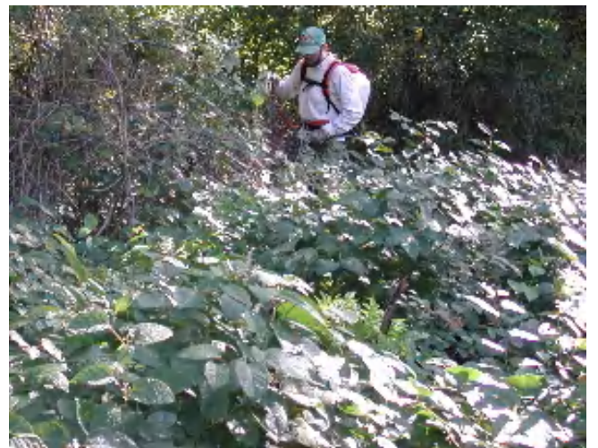
Figure 8. After cutting around June 1, a late-summer treatment to the waist-high knotweed regrowth is easily made with a backpack sprayer.