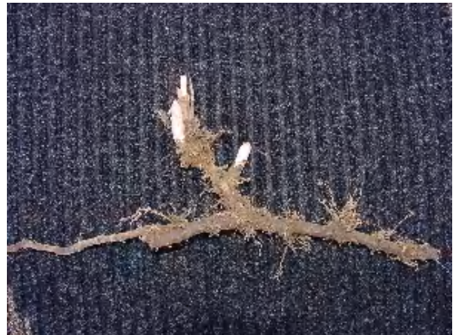
Figure 4. A Japanese knotweed rhizome fragment showing newly emerging shoots, roots, and rhizome branches.