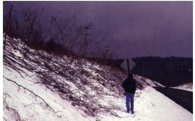
Figure 6. Frost seeding a cool-season grass mix into a stand of giant knotweed. The grasses develop into a competitive groundcover after the giant knotweed canopy is removed with a selective herbicide application in the spring. This approach has not been successful with Japanese knotweed.

When knotweed has been cut and the shorter