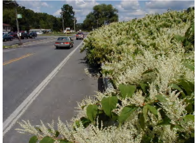
Figure 1. Showy flowers of Japanese knotweed. The knotweeds were introduced to the U.S. in the late 1800's as ornamentals due their prominent late-season flower display and striking height. Due to its great size, knotweed reduces sight distance and encroaches on the travel lanes, particularly on secondary roads.

The key to controlling knotweed is controlling the rhizome system of the plant. Knotweed is one of those