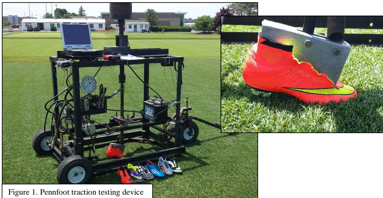
Figure 1. Pennfoot traction testing device

Each shoe was tested on FieldTurf Revolution and Kentucky bluegrass ( Poa Pratensis ). The FieldTurf Revolution test plot included a sand-rubber infill combination installed into 2.5 inch fibers. The test plot of Kentucky bluegrass was grown on a sand-based rootzone and included the following cultivars: 30% Everest, 30% Botique, 30% P105, and 10% Bewitched. The mowing height was 1.25 inches and the plot contained 100% turf coverage. The volumetric soil water content at the time of testing was 25.1%.