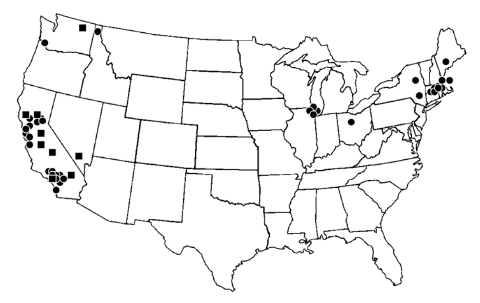
Fig. 3. Geographic distribution of Waitea circinata var. circinata isolates identified in this study. Circles represent the approximate geographic origin of isolates used in this study, while squares represent the origin of previously characterized isolates (5). Outline map generated using Smart Draw (San Diego, CA).

Data obtained from our disease diagnostic clinic at UC Riverside indicate that W. circinata var. circinata is the dominant Rhizoctonia disease of annual bluegrass in California. From 2006 to 2008, more than 90 Rhizoctonia isolates were obtained from California annual bluegrass putting green samples showing symptomatic yellow rings. Only two of these were identified as R. zeae (W. circinata var. zeae), none as R. oryzae (W. circinata var. oryzae), and two as R. cerealis (F. Wong, unpublished data); the rest appeared to be W. circinata var. circinata based solely on morphological characteristics and timing of the disease (15 to 35°C maximum daytime temperatures with the majority of samples arriving during periods of 25 to 30°C maximum daytime temperature). Of some >500 annual bluegrass putting green