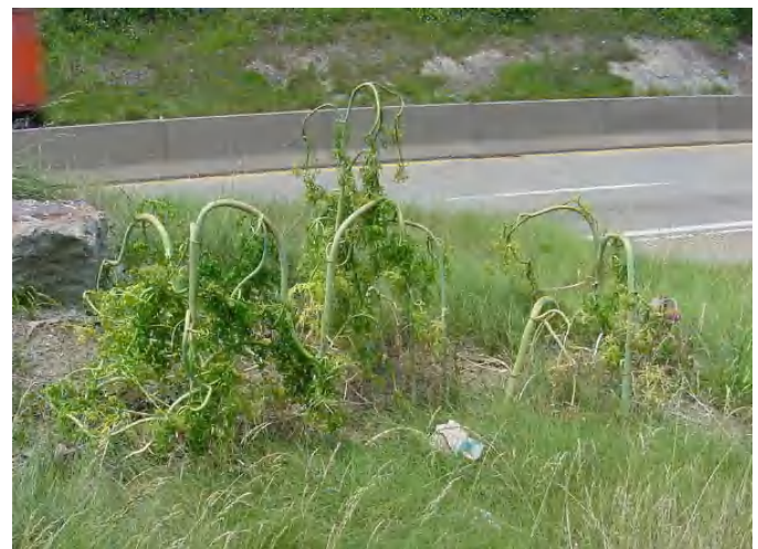
Figure 5: Poison hemlock, injured by an application of a selective herbicide that injures broadleaved weeds but not grasses.

An example of a selective soil application would be controlling crabgrass in a home lawn. The herbicide, often combined with a fertilizer as a 'weed-and-feed' product, is applied in the spring before crabgrass germinates. This herbicide is only effective on germinating seedlings because it prevents roots from growing, and because it is immobile in the soil and stays at the soil surface - where the crabgrass seed is. The roots of the lawn grass are already present, and they are growing beneath the herbicide, so the turf is not affected. This is also why some herbicides can be applied in a flower bed right after you plant the flowers - the flowers already have a developed root system and the root system is below the herbicide.