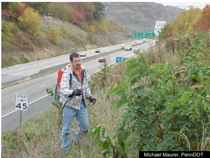
Figure 6: A selective application of an herbicide mix to roadside brush. The backpack sprayer with a nozzle that delivers a small volume of spray solution is well suited to selectively treating target weeds and leaving the desirable groundcover uninjured.

IVM is more than simply being able to say that you have a whole 'laundry-list' of programs for managing vegetation. Coordinating, or integrating these elements together to get you closer to your desired groundcover is