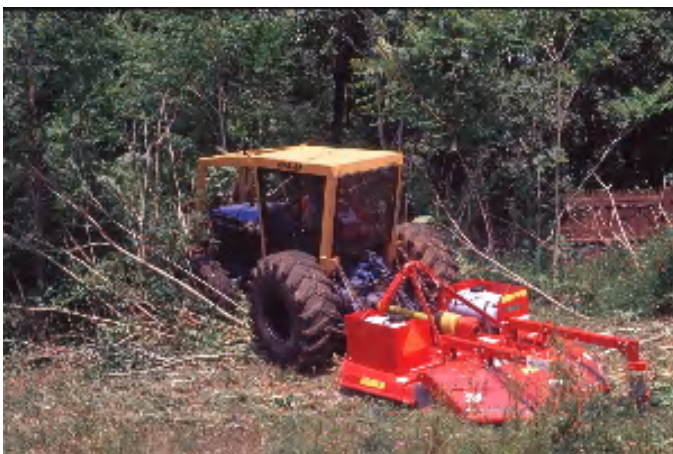
Figure 3: Clearing small-diameter brush with a mower that treats the brush stubble with herbicide as it cuts. This provides increased recovery area and sight distance, and prevents brush re-establishment.

When soil needs to be taken from borrow areas, choose sites that do not contain perennial weeds. If there are sites designated as borrow areas, include these areas in routine weed management programs to prevent weeds from getting established and spreading to other sites.