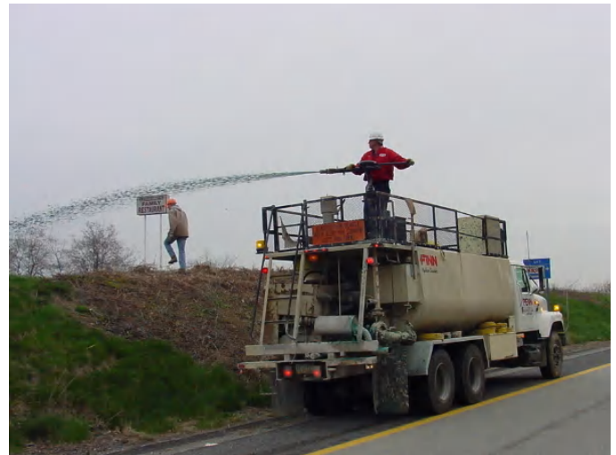
Figure 2: Hydraulic seeding of a mixture of grasses to a roadside area where brush has been cleared. Establishing a competitive groundcover by selecting a well-adapted plant material and using proper establishment procedures helps reduce the opportunity for weeds to infest the roadside.

For our discussion, desirable vegetation is simply any vegetation that is not problem vegetation. Intact,