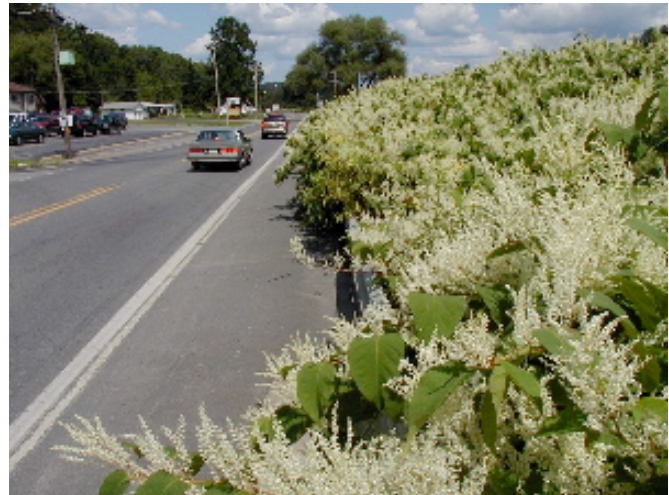
Figure 1. Showy flowers of Japanese knotweed. The knotweeds were introduced to the U.S. in the late 1800's as ornamentals due their prominent late-season flower display and striking height. Due to its great size, knotweed reduces sight distance and encroaches on the travel lanes, particularly on secondary roads.

The key to controlling knotweed is controlling the rhizome system of the plant. Knotweed is one of those plants best thought of as being like an iceberg - what