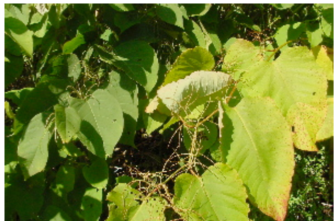
Figure 2. Japanese knotweed (left) and giant knotweed (right) occur throughout Pennsylvania. The leaves of Japanese knotweed are usually 4 to 6 inches long, while the leaves of giant knotweed can reach 12 inches in length and are distinctly heart-shaped. Though often confused with each other, there is little chance of confusing these imposing plants with any other species. The knotweeds have similar adaptations and growth habits, and can be regarded as equally problematic.

By Art Gover, Jon Johnson, and Larry Kuhns, 2005. This work was sponsored by the Pennsylvania Department of Transportation. The contents of this work reflect the views of the authors who are responsible for the facts and the accuracy of the data presented herein. The contents do not necessarily reflect the official views or policies of either the Commonwealth of Pennsylvania or The Pennsylvania State University, at the time of publication. This work does not constitute a standard, specification, or regulation.