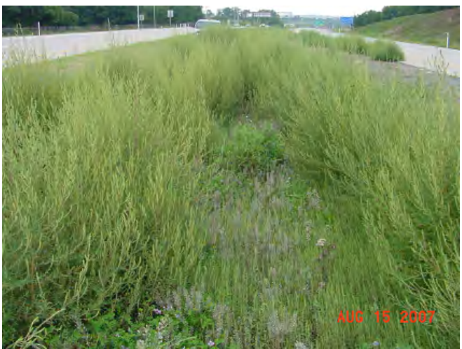
Figure 3. A mature stand of unwanted kochia growing in guiderail areas within the median.

germination through the season. Within a few years of being introduced in the 1980's, sulfometuron applications stopped being effective against kochia in the Midwest and Plains states. Widespread, repeated use of sulfometuron and closely related chemicals selected for a strain, or biotype, of kochia that was resistant to these herbicides.