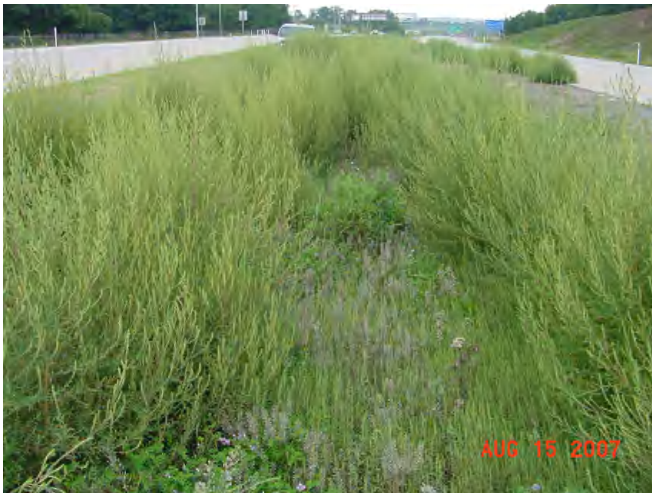
Figure 3. A mature stand of unwanted kochia growing in guiderail areas within the median.

germination through the season. Within a few years of being introduced in the 1980's, sulfometuron applications stopped being effective against kochia in the Midwest and Plains states. Widespread, repeated use of sulfometuron and closely related chemicals selected for a strain, or biotype, of kochia that was resistant to these herbicides.